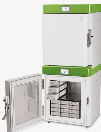
Two SU105UE freezers shown stacked. Stacking adapter kit sold separately. *Stacking the SU105UE may void UL 471 certification.